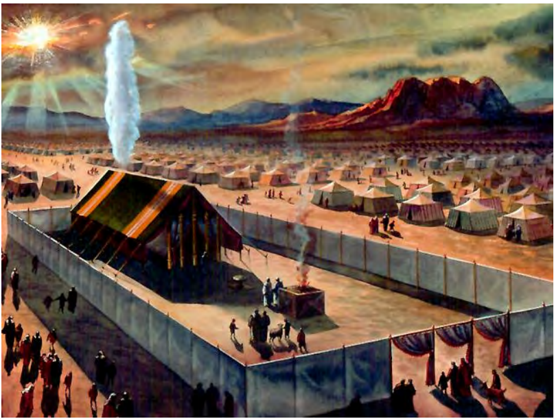
Figure 2. Tabernacle at the Foot of Mount Sinai9

Looking at the passage more closely, however, raises several questions, especially in light of the possibility that some redactors may have been motivated to defame or belittle the character of Noah in the interest of making the role of Moses more prominent or unique.8